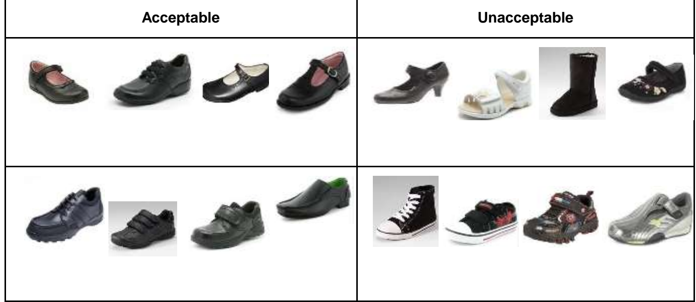
(Please note that this is not an exhaustive list, if you have any specific questions please ask.)